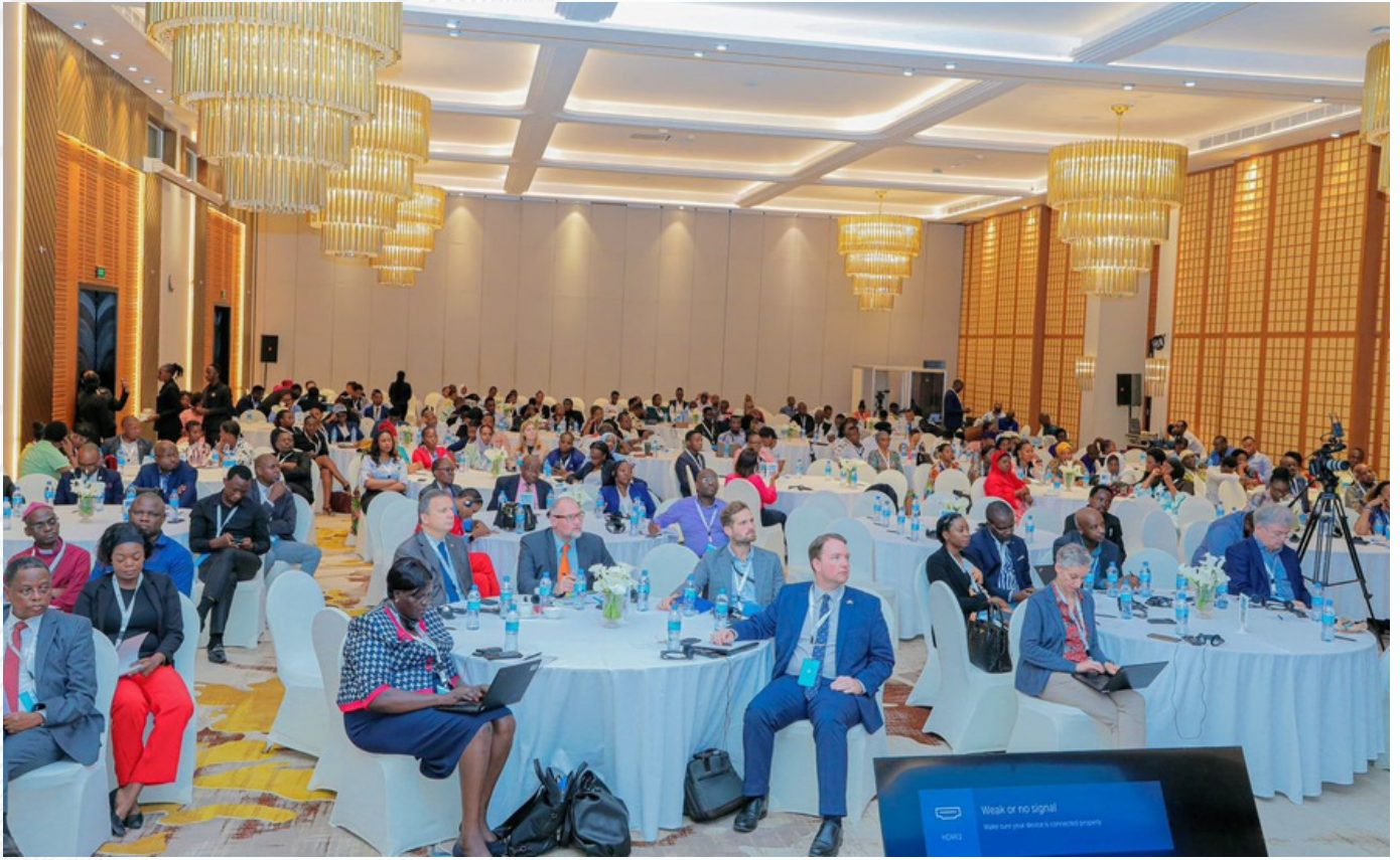
Audiences during International Human Rights Day and the 75th anniversary of the Universal Declaration of Human Rights (UDHR).