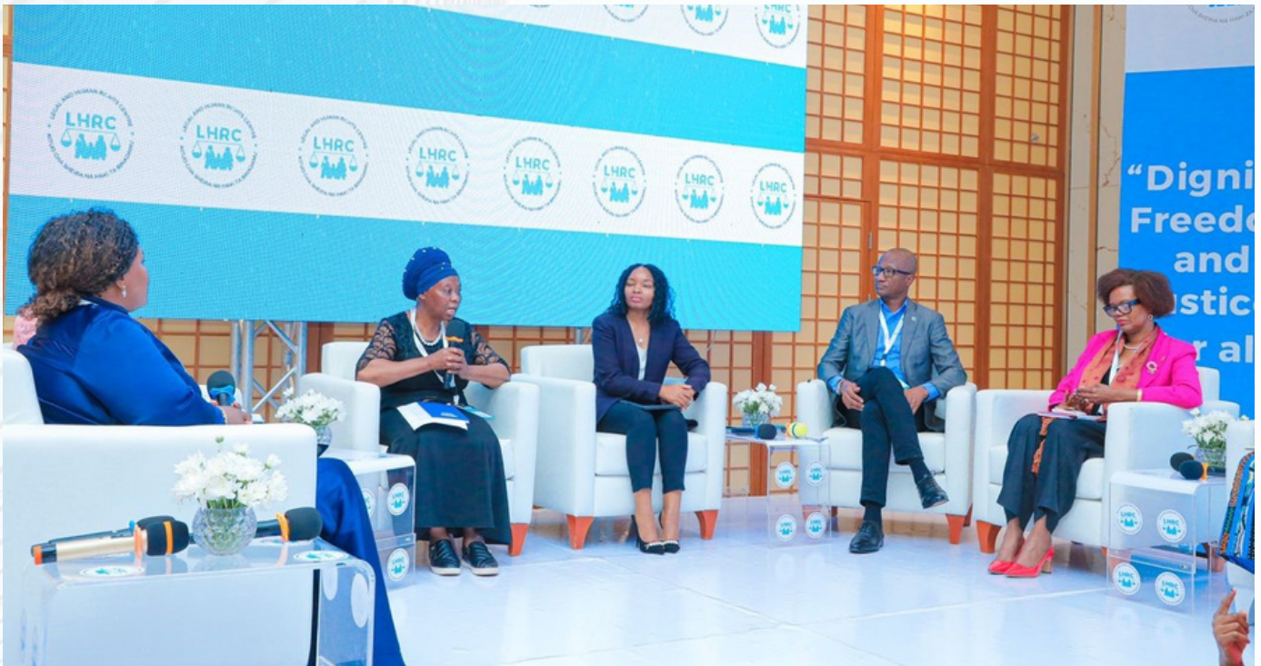
Panelists during the discussion on the commemoration the International Human Rights Day and the 75th anniversary of the Universal Declaration of Human Rights (UDHR).