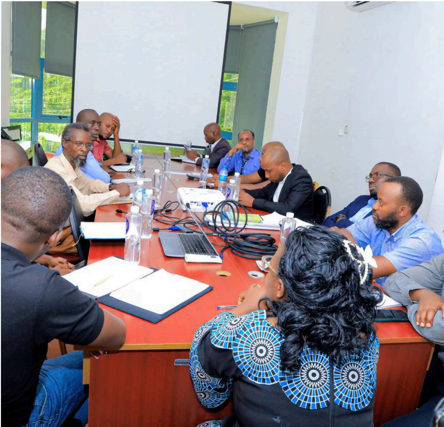
Students from Ruaha Catholic University with the LHRC team during an insightful meeting, fostering collaboration and knowledge exchange.

Additionally, they applauded the Centre for offering free legal aid services at no cost.