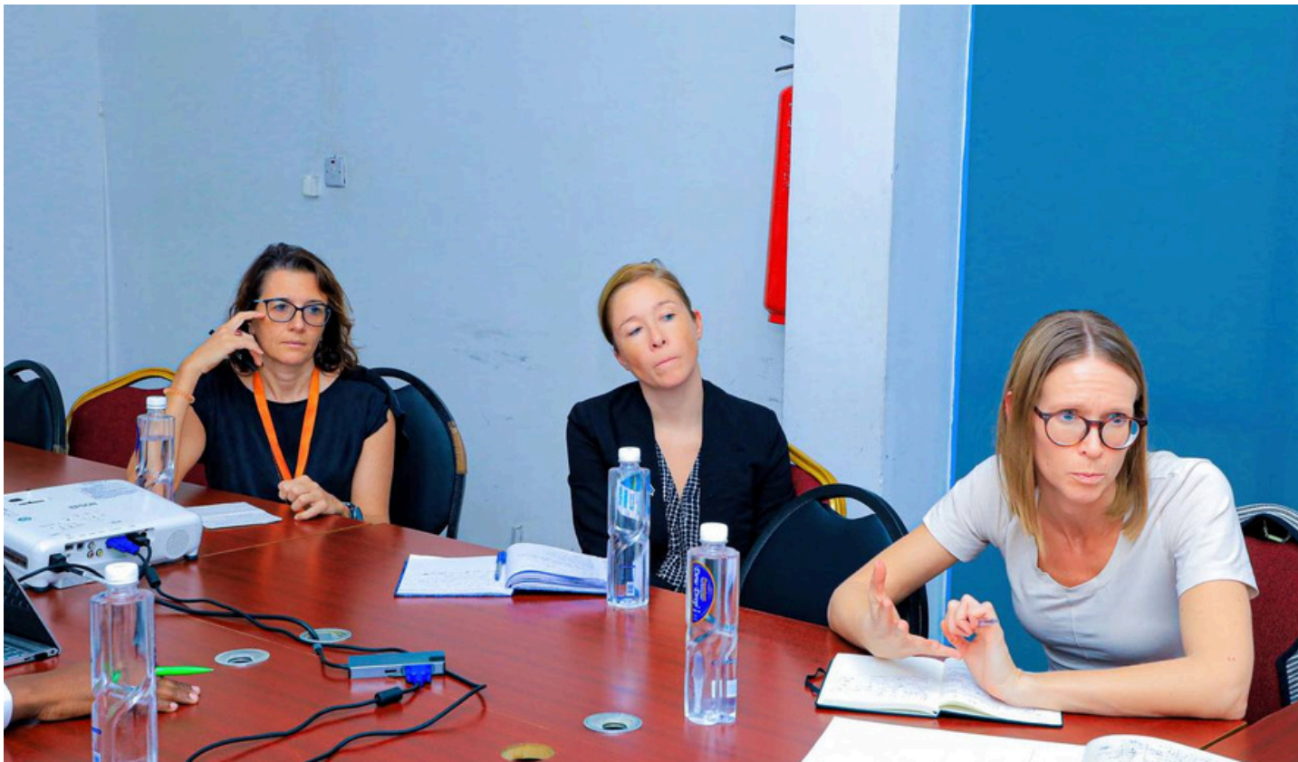
Delegates from the European Union visited LHRC's headquarters in Kijitonyama for an insightful meeting.