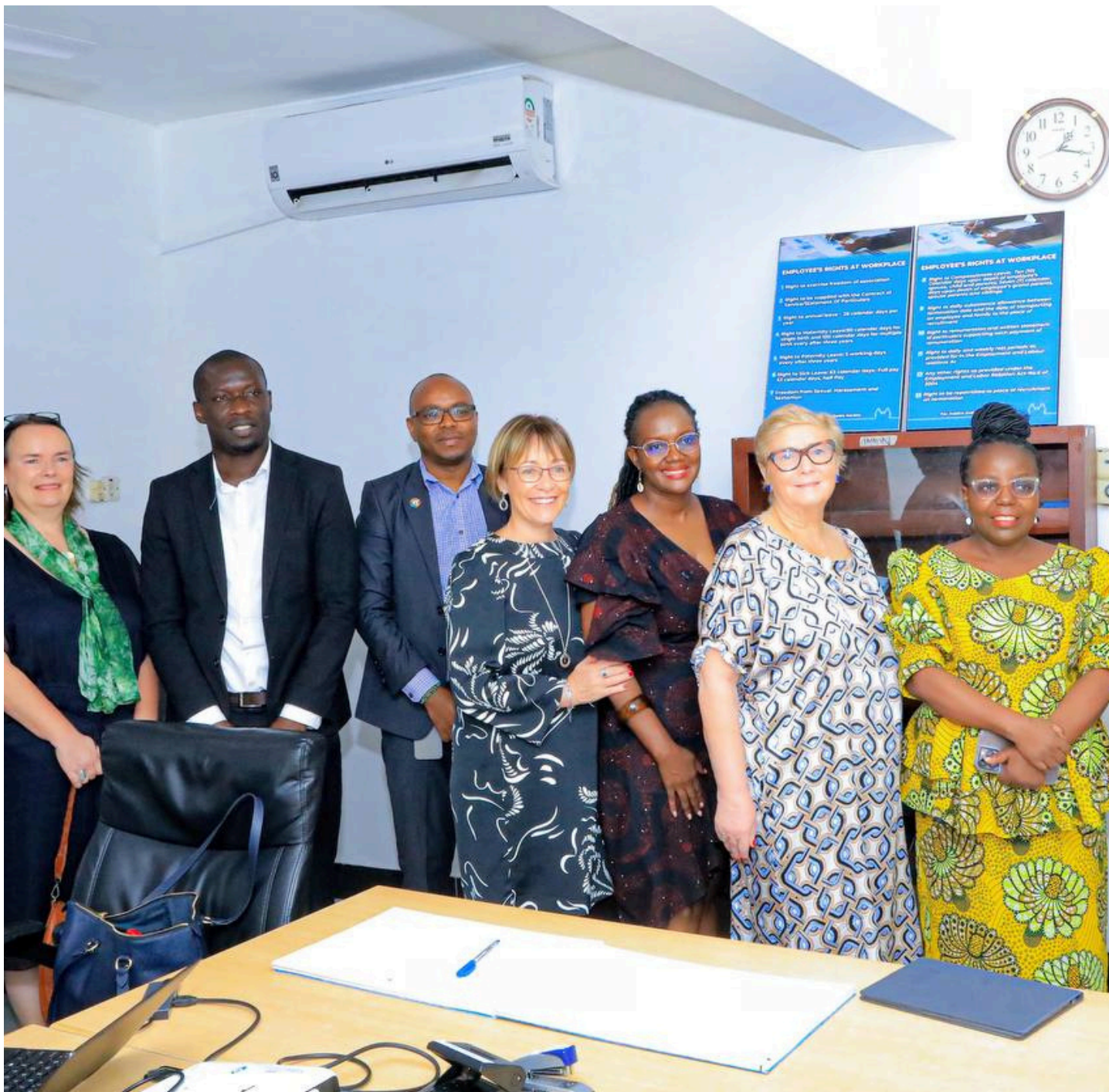
Hon. Frances Fitzgerald, a senior Irish politician, alongside delegates from the Embassy of Ireland in Tanzania and key civil society leaders, during their visit to LHRC Legal Aid.

During the discussions, Hon. Fitzgerald shared Ireland's experience in advocating for human rights and how the country's legal system ensures access to justice, while offering her insights on potential reforms that could strengthen the legal aid system in Tanzania.