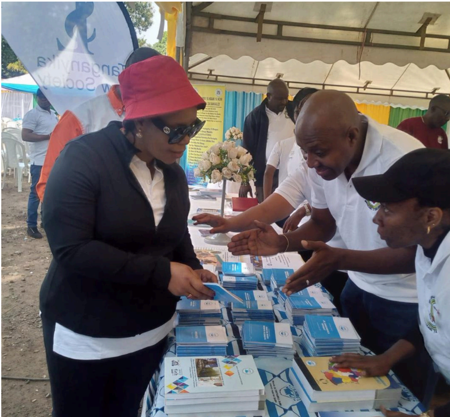
Arusha team in action during Law Week 2025 at TBA, Arusha, showcasing their dedication and commitment to justice.

This year's Law Day theme was "Tanzania 2050: The role of institutions that oversee justice in achieving the goals of the national development vision."